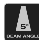
Beam angle 5°

Improved far and near field illumination